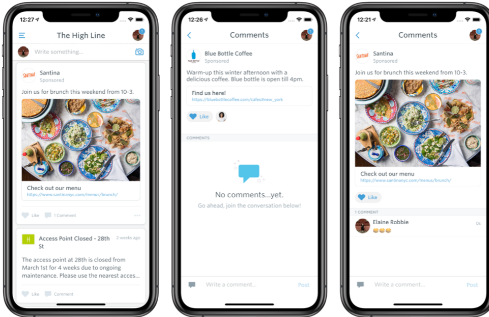
Image Dimensions: Sponsor Avatar: 180px wide, 180px tall .jpg/.png;

Card Image: 650px, 450px tall .jpg/.png: