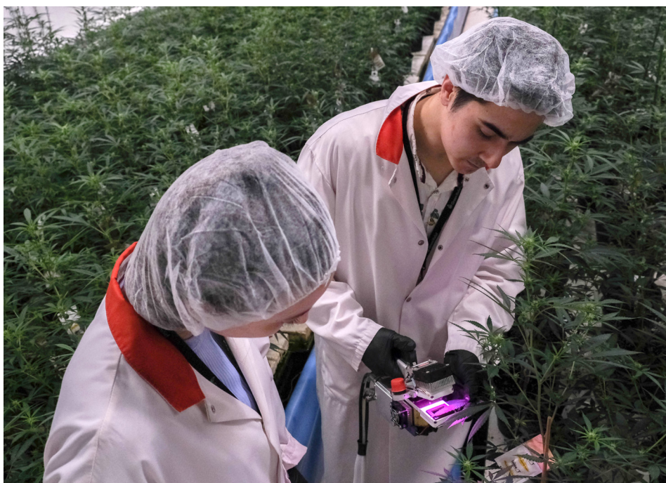
Yep and Moher utilize new technologies for analyzing cannabis leaves with a portable photosynthesis system.

Learn more about these courses and the larger horticulture program by visiting uoguelph.ca/horticultureonline .